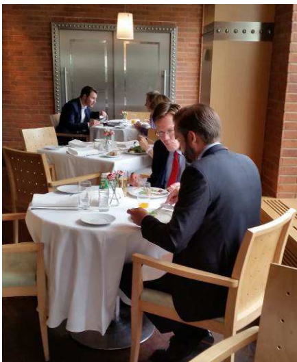
Lunch with corporation's representatives