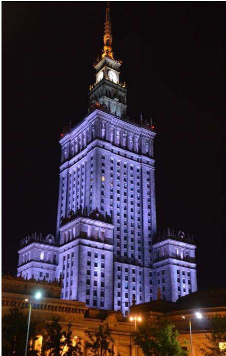
Warsaw Palace of Culture and Science by night