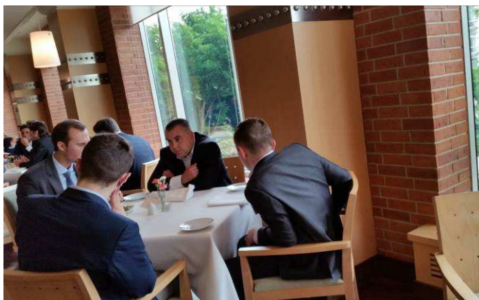
lunch and preparing afternoon conference sessions