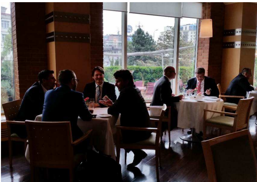
Lunch and communications