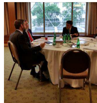
Round table discussion