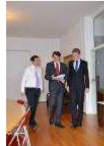
Dr. Kalliwoda Research in FFM