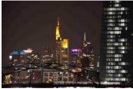
Skyline Frankfurt am Main