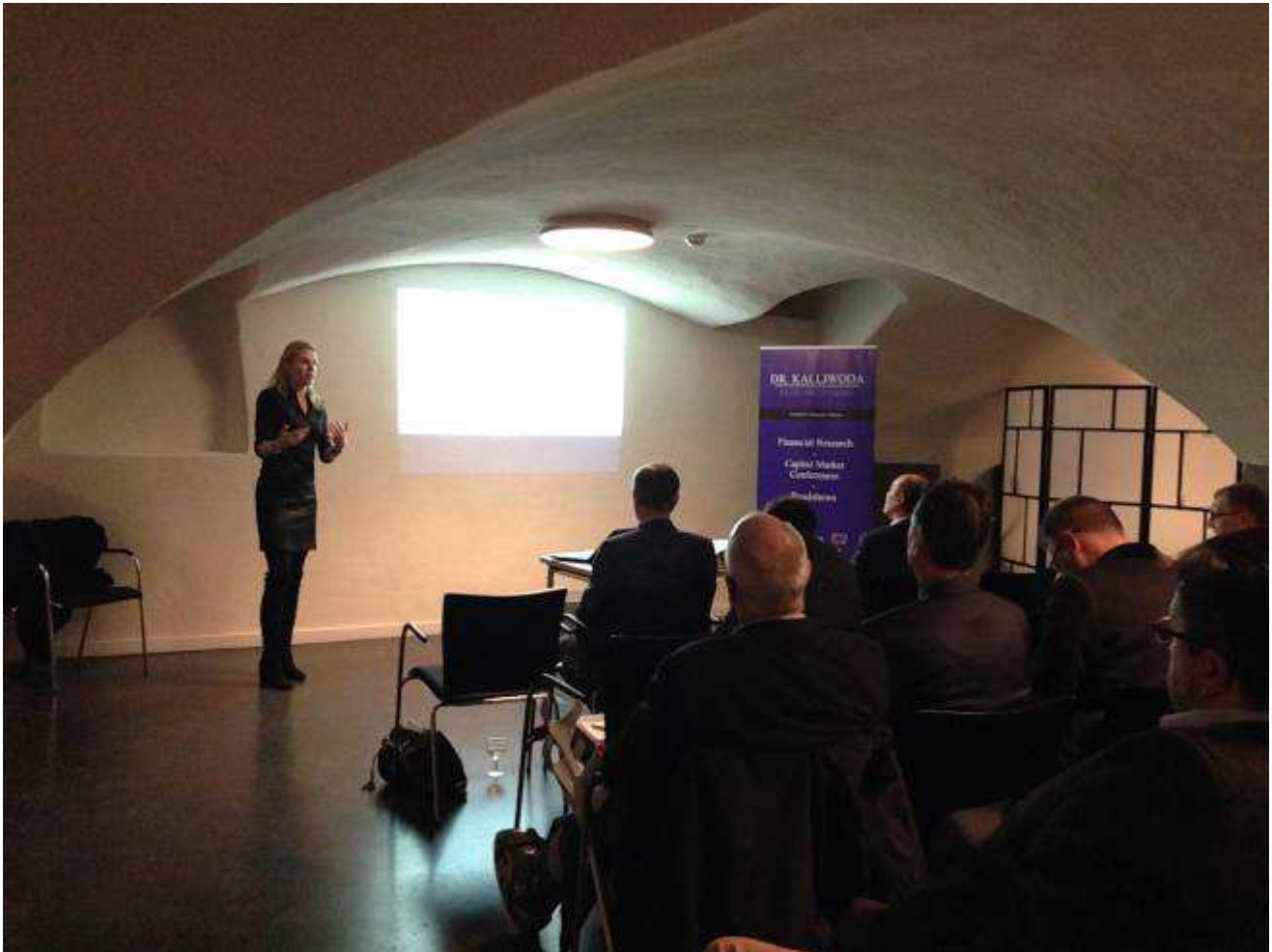
Perspective view of the presentation and one of the presenter