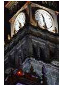
Warschau City, Zentrum