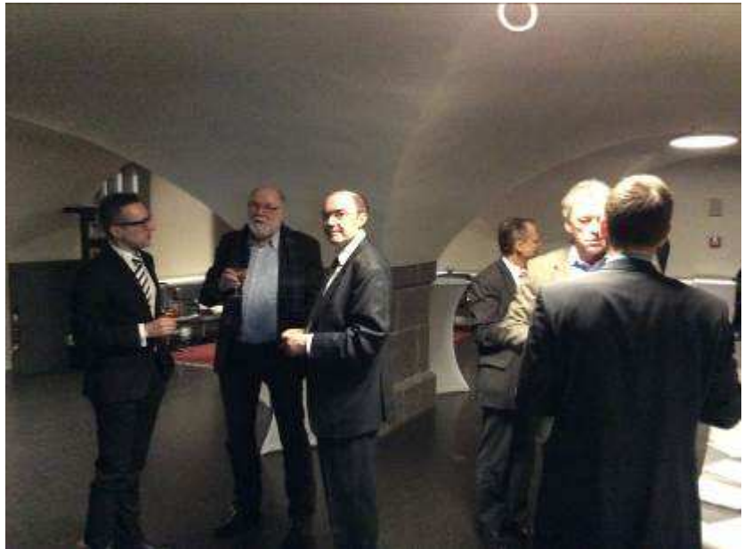
During the conference