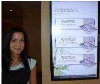
Unsere Konferenz in Warschau/Teammitglied