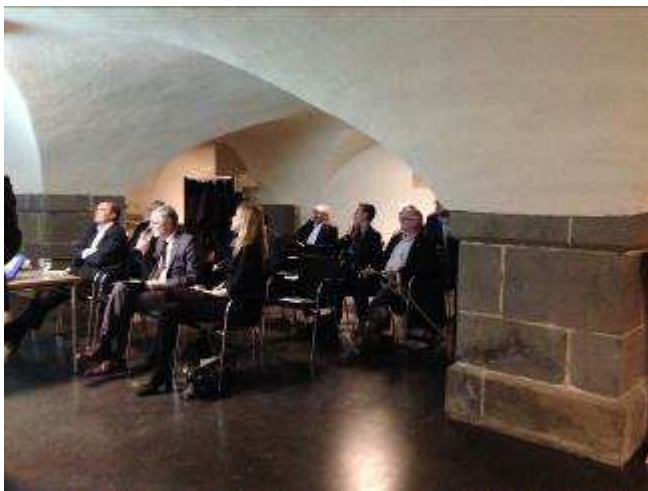
Presentation Area in 400 years old environment