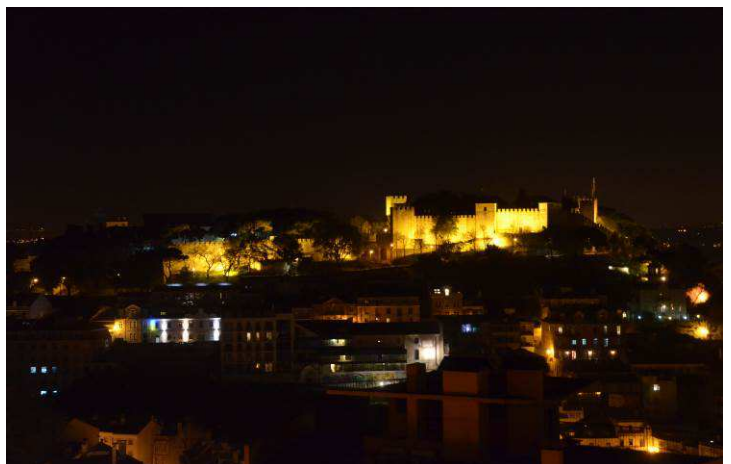
Castillo de San Jorge at night