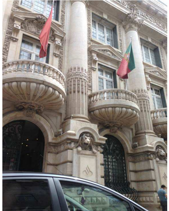
Banco Santander offices in Lisbon