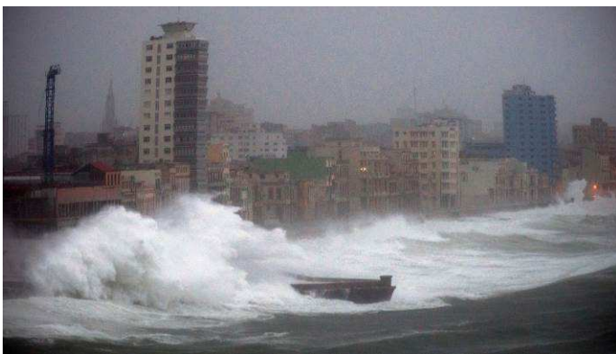
Damage by Hurricane Irma