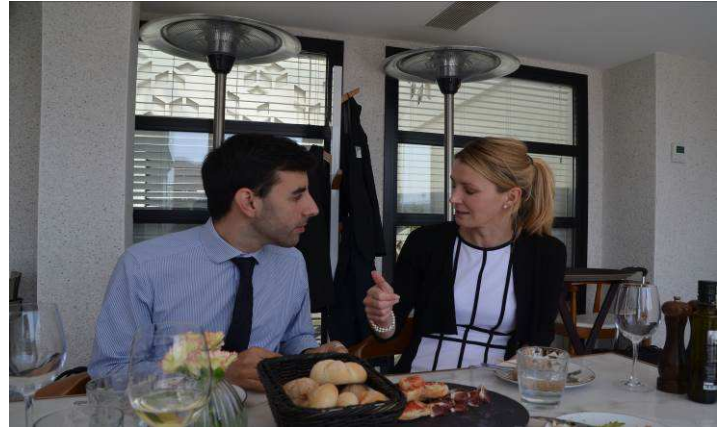
Corporate Client and Investor talking over lunch