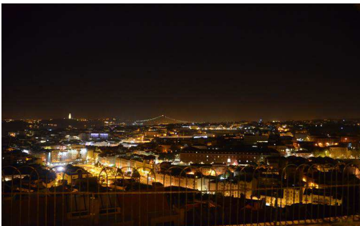
Lisbon at night