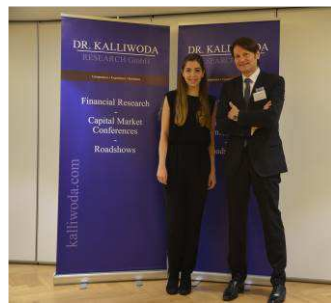
Team-Mitglied in Madrid