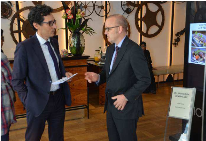
Corporate Client and Investor talking over lunch