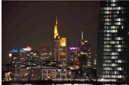
Skyline Frankfurt am Main