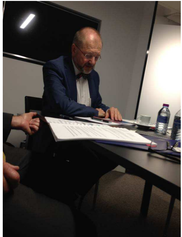
One-on-one taking place