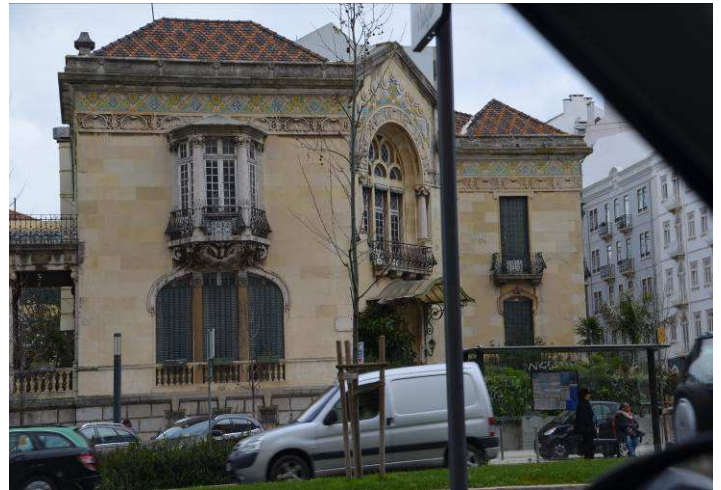
Old manor-like house