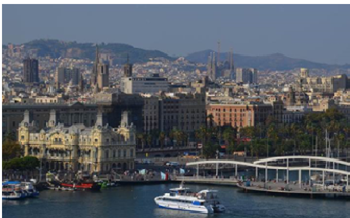
Puerto de Barcelona