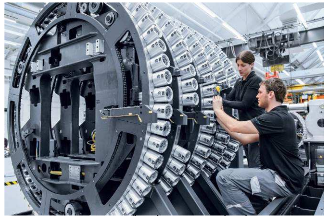
manufacturing systems engineering