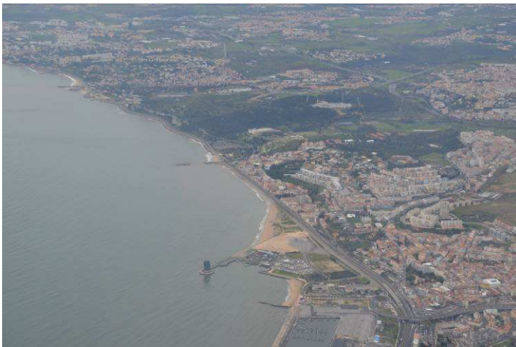
Aerial view of Lisbon