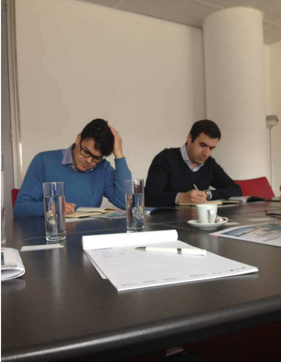
One-on-one taking place