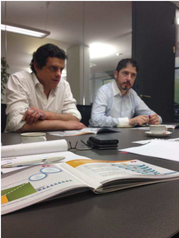
One-on-one taking place