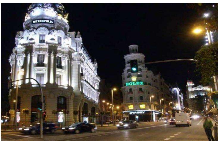
Gran Vía at night