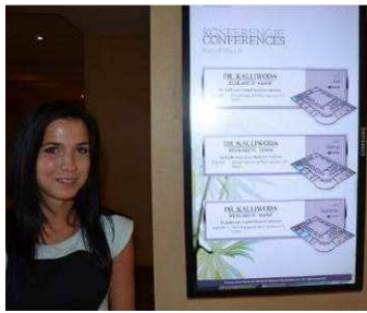
Team-Mitglied in Warschau