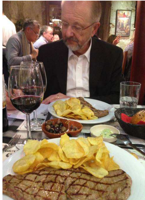
Dinner at a Portuguese restaurant