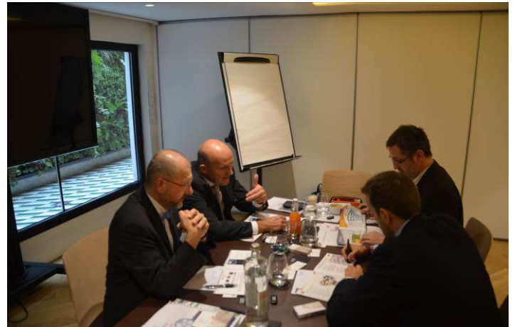
One-on-one between the Corporate Clients and the Investors