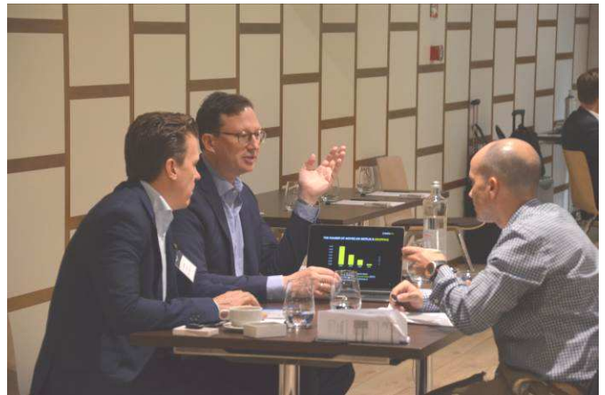
Corporate Client & Investors